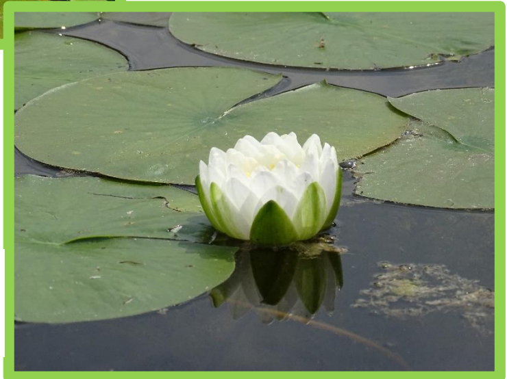
White Water Lily Nymphaea odorata